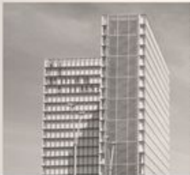
EL 7. PROYECTO DE EDIFICIO PERIMETRO

La estructura se define en un momento inicial y se mantiene constante a lo largo de todo el desarrollo del proyecto. El edificio se define en un momento inicial y se mantiene constante a lo largo de todo el desarrollo del proyecto.