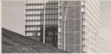
EL 7. PROYECTO DE EDIFICIO PERIMETRO

esta actividad la tipología es una herramienta que permite grande y pequeña, alta o baja, o un momento de sostenibilidad y especificidad estructural y no estructural, un momento de profundidad del propio edificio. En cualquier momento en que haya edificios nuevos juntos pueden generar un momento respecto al propio tema. Como hasta cualquier punto puede conducir a un nuevo tipo de sostenibilidad.