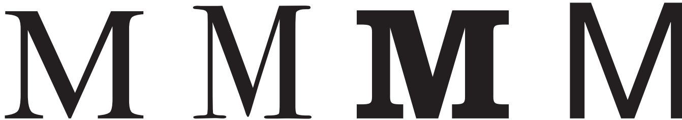
bracketed serif joins at a curve